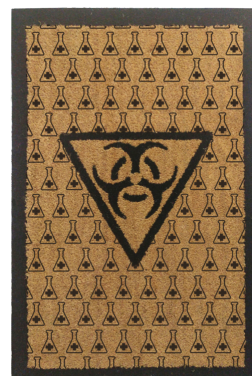
ANTONIO RIELLO B-88, 2020

135 x 90 cm (h x w) 100% recycled coconut fibre GBP 6000