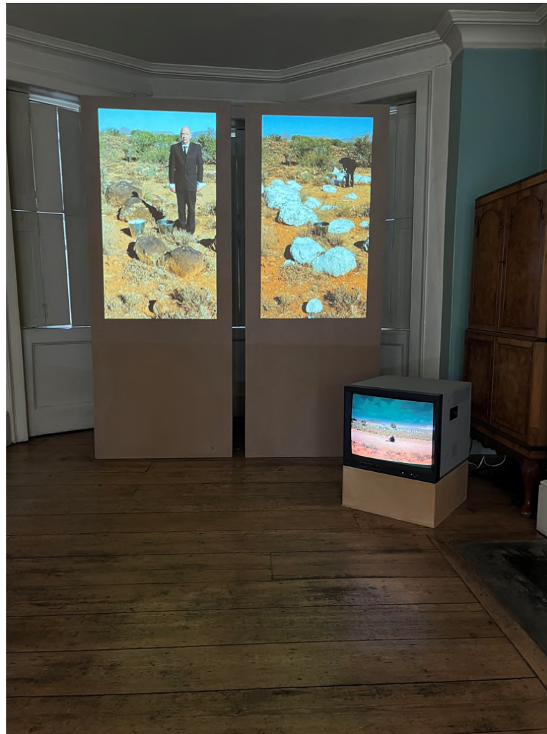
Experiments in Black and White XXVIII – Small Acts (2019)

Two screen projection and a small cube monitor. Filmed in Richmond, South Africa – Modern Art Projects 2019